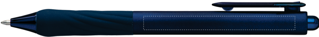
Bluew/ Black Ink