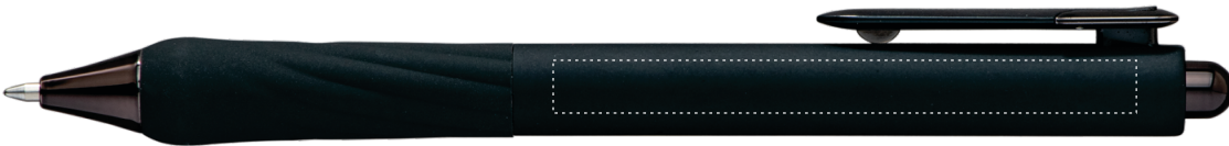
Black w/ Black Ink